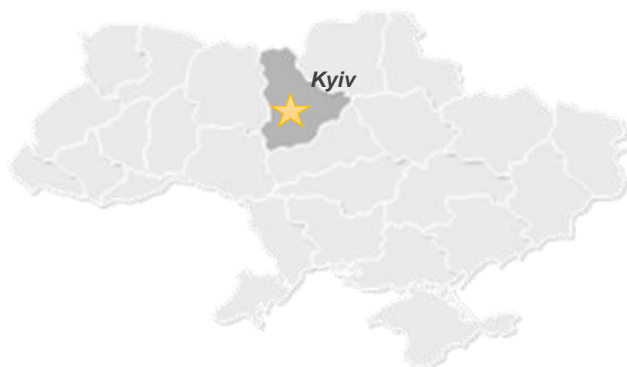
Map of Ukraine