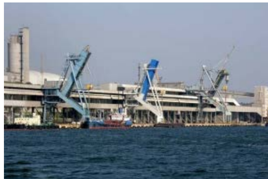
Odesa Port Plant is put up for sale

European and Latin American companies interested in buying Ukraine's largest chemical producer